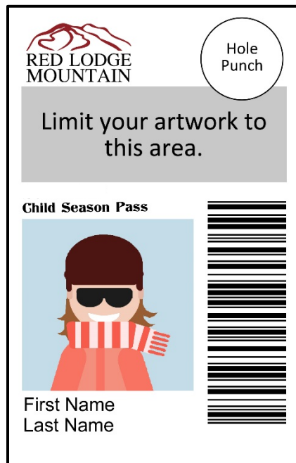
Actual Season Pass Size

The winning artist will have their artwork printed on all 2019/20 Child Season Passes, and will earn a FREE 2019/20 Child Season Pass.