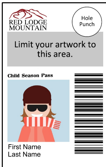
Actual Season Pass Size

The winning artist will have their artwork printed on all 2019/20 Child Season Passes, and will earn a FREE 2019/20 Child Season Pass.